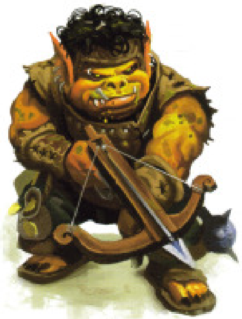
Balgron the Fat

Once the gnome was out of sight, the party returned to the secret door and Shadow carefully pushed it open. Beyond, the drow found the fat goblin of whom Agrid had spoken, snoring loudly. The rogue attempted to capture the creature but he was too slippery and wriggled loose, screaming loudly for help.